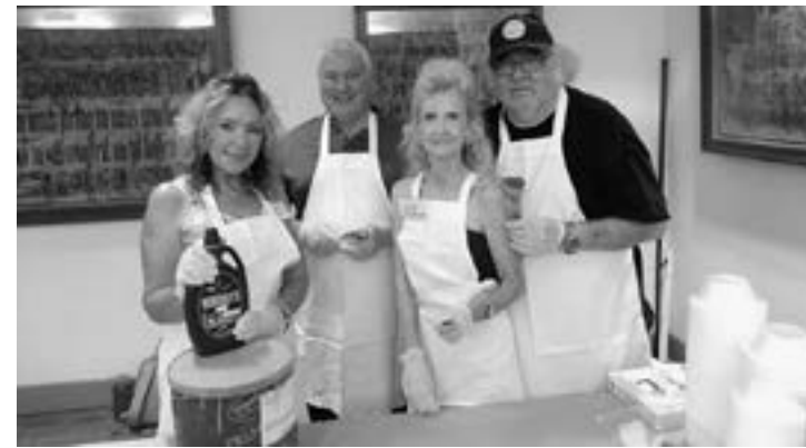
Historic Ephrata Cloister Annual Ice Cream Social