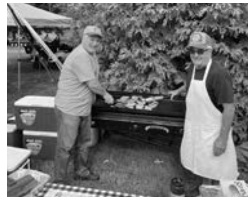
Heritage Days in Intercourse