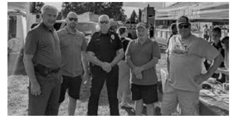
National Night Out in Akron