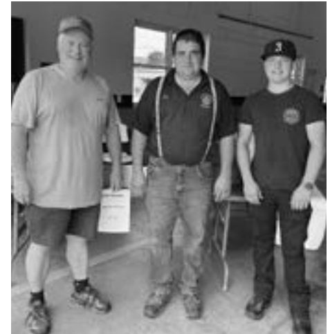
Martindale Day in Earl Township