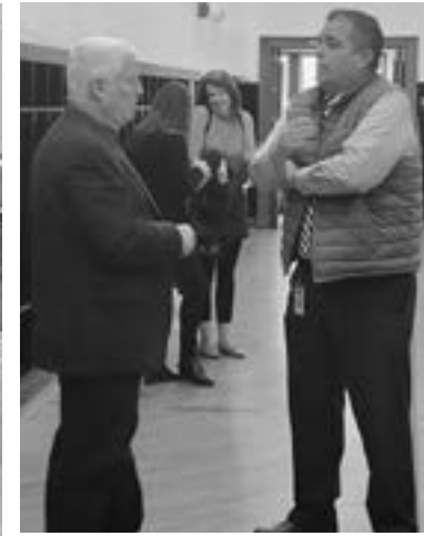
Pequea Valley “Together Initiative”