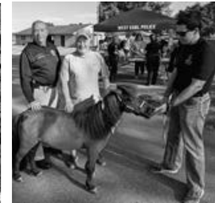
Mental Health Awareness Event in West Earl Township