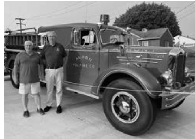
Akron Volunteer Fire Co. Open House

Over the past year, I have had the pleasure of meeting many of you in your community, at special events or observances, and through my participation at numerous festivals, fairs, school and local government activities. The following is a sampling: