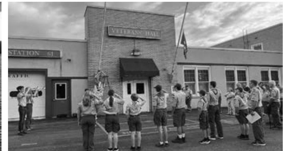
Flag Retirement Ceremony in Upper Leacock Township